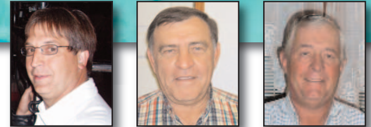
Supervisor Candidates on Page 3